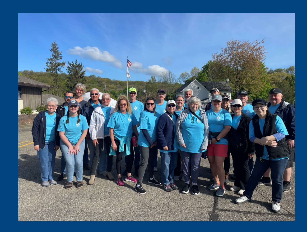
2023 Field Trip Educators and Volunteers